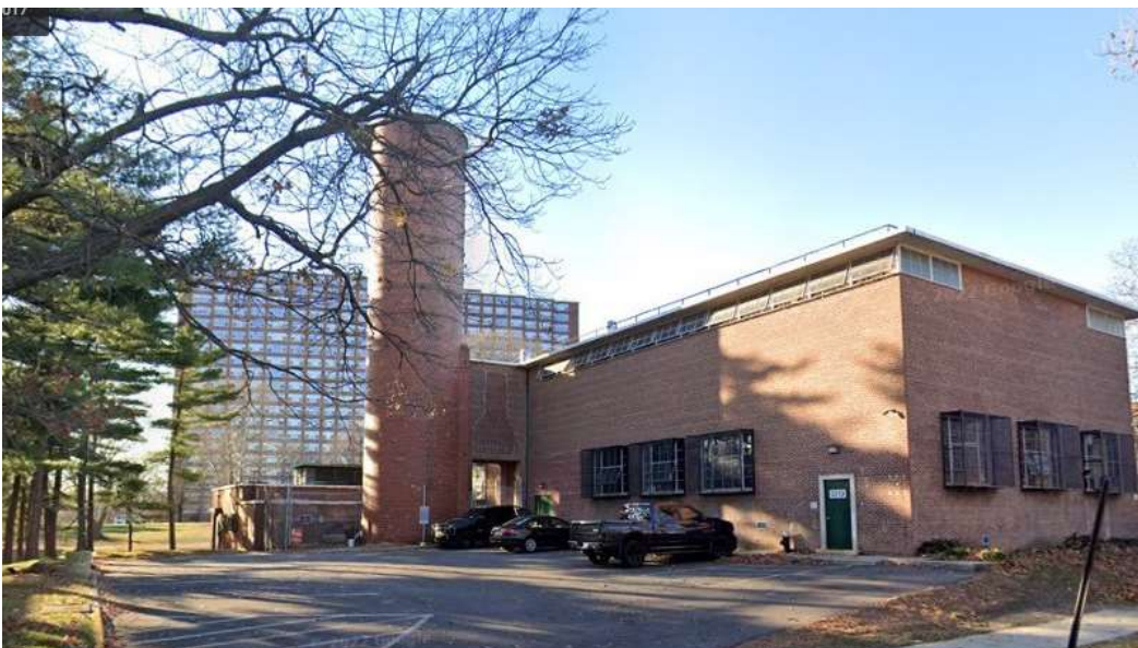
Figure 2. Boiler Facility at 67-19 192nd Street, Fresh Meadows

QFM facility is an existing residential apartment complex with 3,285 units. The complex is situated on 150 acres in Flushing, Queen. The buildings heat and potable hot water are supplied by eight [8] boilers firing natural gas as the primary fuel and distillate #2-oil as the backup fuel. Four [4] of the eight Cleaver Brooks boilers each have a maximum heat input rating of 23.4 million Btu per hour. Each of the other four Cleaver Brooks boilers have a maximum heat input rating of 16.7 million Btu boilers. Figure 2 is a photo of the boiler facility at 67-19 192 nd Street, Fresh Meadows.